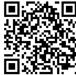
QR Code for Registration